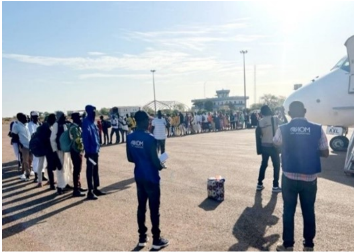
DTM staff assisting returnees during OTA in Malakal @IOM South Sudan 2024

in this area to avoid escalation and further displacements, in addition to the pre-positioning of emergency shelter and relief items.