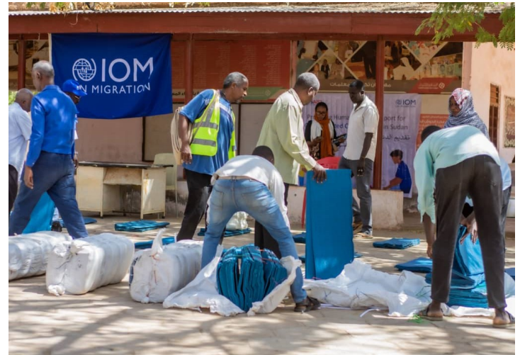
Distribution of NFI kits to IDPs in Sennar State

In addition, through the Rapid Response Fund mechanism, IOM's partners have reached 392,249 direct beneficiaries in Sudan with ES/NFI, WASH, Health, FSL and Protection interventions so far.